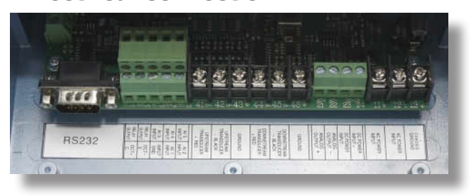
Connect as below