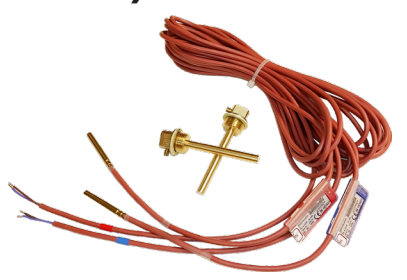
Also available for surface mounting